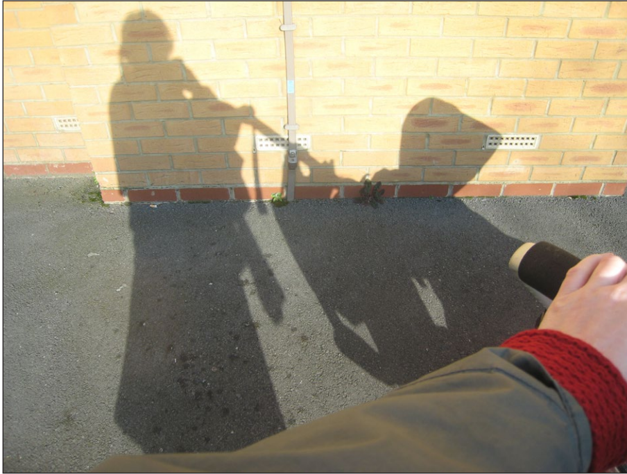
Figure 1: Pram Shadow , walking self portrait, 2012, image Clare Qualmann.

Viewing the city through this new lens feels political. Losing the freedom of easy mobility – a freedom that I hadn't been aware of before – connects me to a massive group of people (predominantly women) in the same position, encumbered by wheels. This became the premise for Perambulator – making this visible through a mass walking with prams. So, simply, pram users were invited to meet at the gallery, and go for a walk around the neighbourhood.