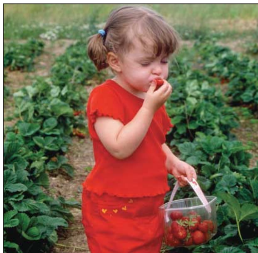
But will she eat her greens?

We maintained the key principles of avoiding bias and maximising transparency and accountability when conducting a systematic review. Both types of study went through a stage of quality assessment with two reviewers working independently and then meeting to discuss their findings. We used different tools for the different types of studies, building on recent developmental work and established consensus on quality assessment for both experimental studies 3-6 and qualitative research. 7-11 The studies were assessed in terms of reporting quality, internal validity or reliability, and, for qualitative studies, the extent to which the findings were rooted in children’s perspectives (box).