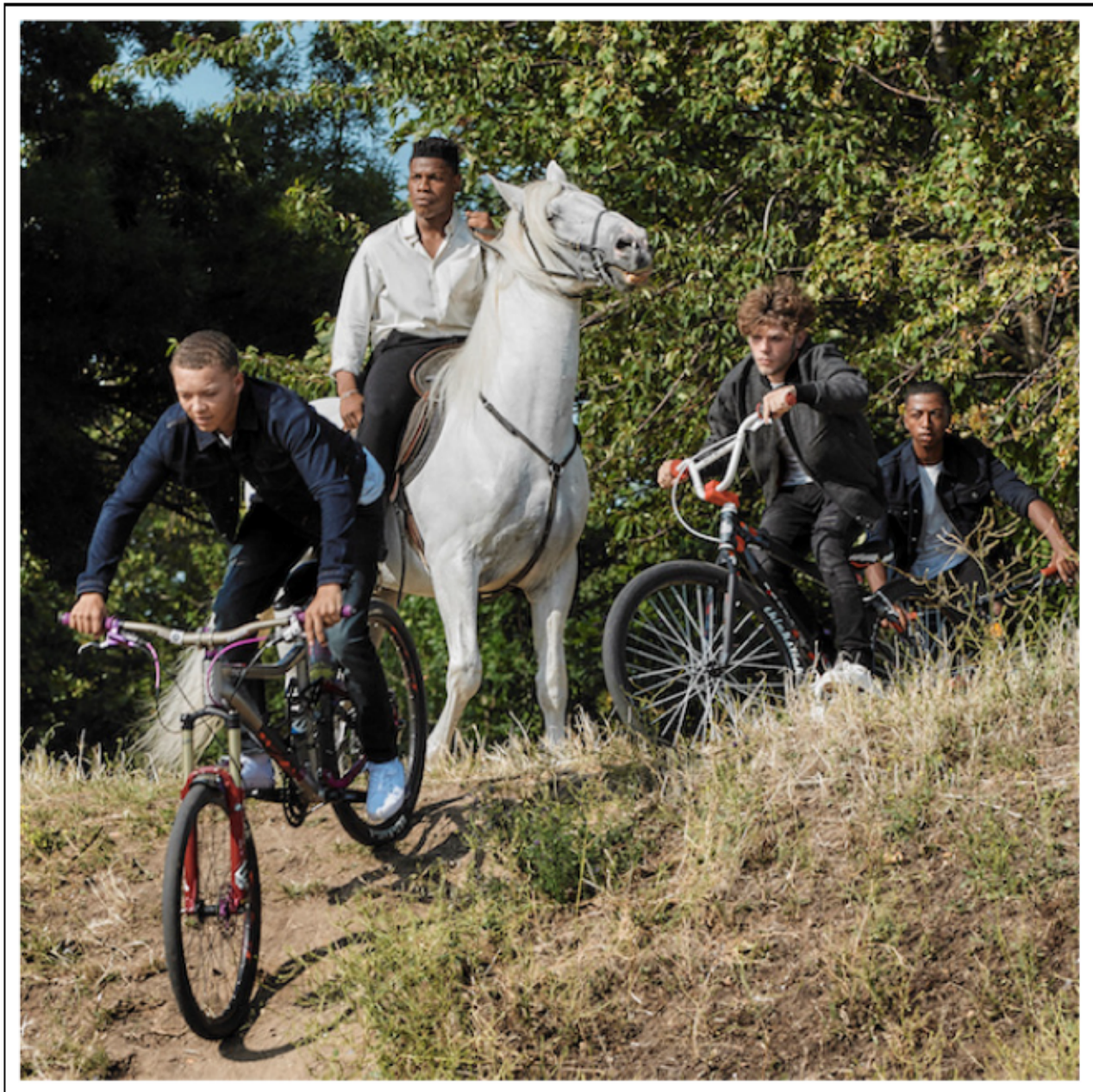
Figure 2. Jo Malone “London gent” advertisement featuring John Boyega.