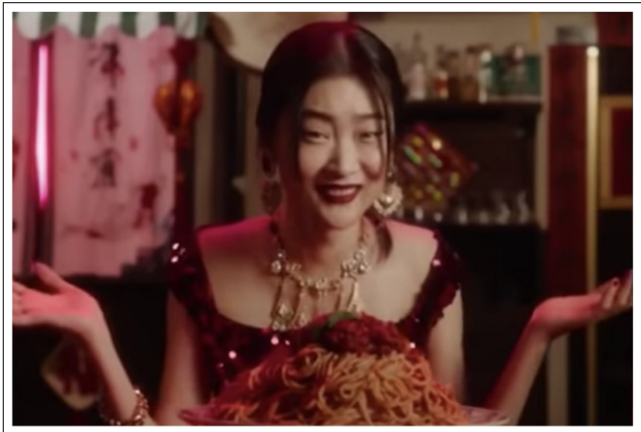
Figure 3. Dolce & Gabbana (D&G) advertisement for the Chinese market.

The founders of the company did release a contrite apology video outlining their respect for the Chinese nation, its history, traditions, and people; however, this was not well received by Chinese consumers, particularly considering the alleged comments attributed to the company co-founder. As a result, the brand has suffered significant damage in the crucial Chinese market for luxury goods (McEleny 2018). The advertisement attempted to employ humor as a device for the Chinese