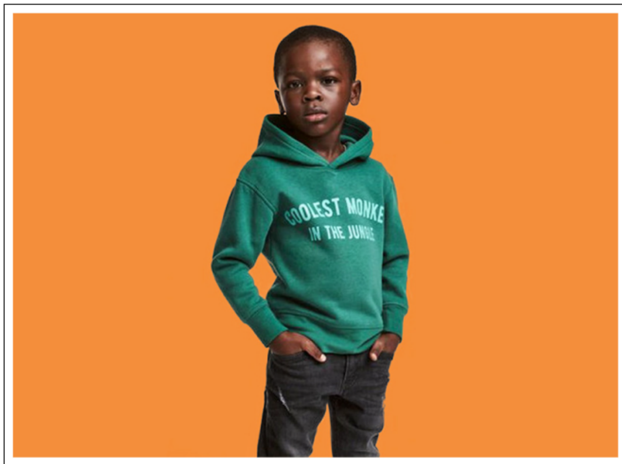
Figure 1. H&M "coolest monkey in the jungle" advertisement.

Although the actor stated he understood why the firm would wish to use local actors in different international regions, he also highlighted that the decision to replace him with a