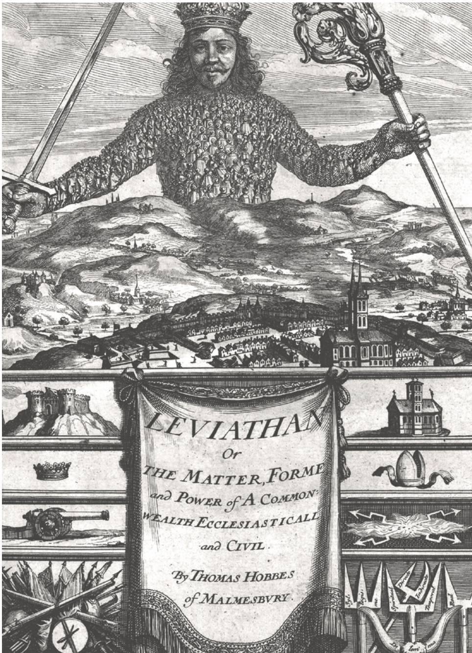
Leviathan frontispiece, Abraham Bosse, 1651