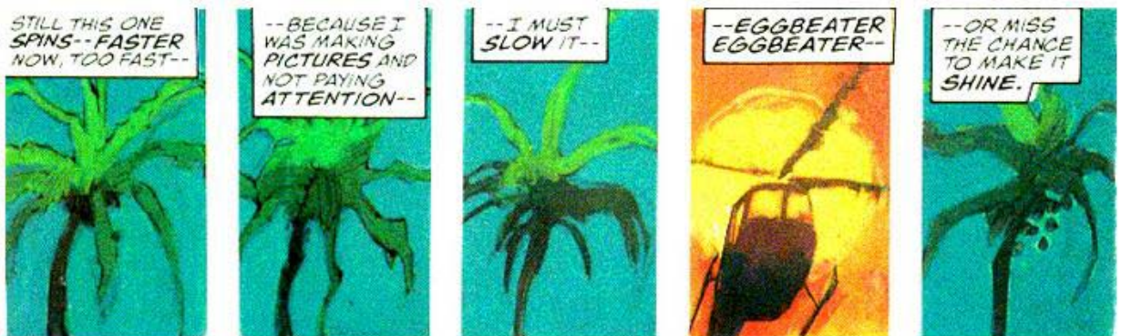
Figure 2. Elektra: Assassin (Frank Miller and Bill Sienkiewicz), p. 2. Repeated panels and the visual trope of the helicopter's blades rhyme with the fronds of the palm tree.

Elektra's attempts to slow that memory down, drag it out, and extend it so she may repose within it, are interrupted by the inevitable advancement of time, even within a contrived memory. Miller uses the visual trope of the helicopter's blades "rhyming" with the fronds of the palm tree to show the slow but inevitable arrival of the assassins who destroy Elektra's mother, injure her father, and bring on her birth. [Figure 2] This memory also introduces the on-going motif of the uselessness of men in Elektra's life to provide protection. To explain why Elektra chooses this memory in which to take refuge we look into more contemporary associations than the mourning and tragedy of the Elektra plays by Sophocles and Euripides. Her name implies the female equivalent of the Oedipus complex (based on the Greek myth of Agamemnon's daughter), proposed by Freud to describe a woman searching for a replacement father figure. We see and understand that Elektra's entry into the world is marked by the violence that leads to her present: assassination, vengeance, and mindfulness.