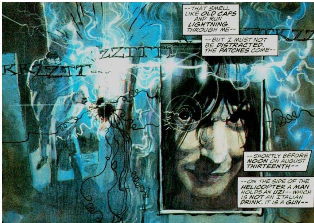
Figure 3. Elektra: Assassin (Frank Miller and Bill Sienkiewicz), p. 3. The close-up of Elektra imposes a timeless quality (as if emerging from or into another time), as her painful present intrudes onto the closed world of her memories.

While the present intrudes into these memories to stress the reason for their re-telling (more than just to fill in the background story), it also provides a sharp break from one point to the next: birth, death, love, loss, a new beginning, loss again, a great fall. Elektra refers to her memories as shiny globes, and she tries to slow down the narratives they spin so that she does not use them up. The best spinning globes are unused, fresh, and lustrous. An inset close-up of Elektra's face intrudes onto these memories. The focus on her eye for vision emphasizes how she "pictures" these memories as an escape from her severely painful present. [Figure 3] This close-up of Elektra makes her presence felt, and imposes a timeless quality (as if emerging from or into another time), as the present intrudes onto the closed world of her memories.