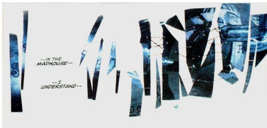
Figure 4. Elektra: Assassin (Frank Miller and Bill Sienkiewicz), p. 29. The panels appear first as shattered fragments.