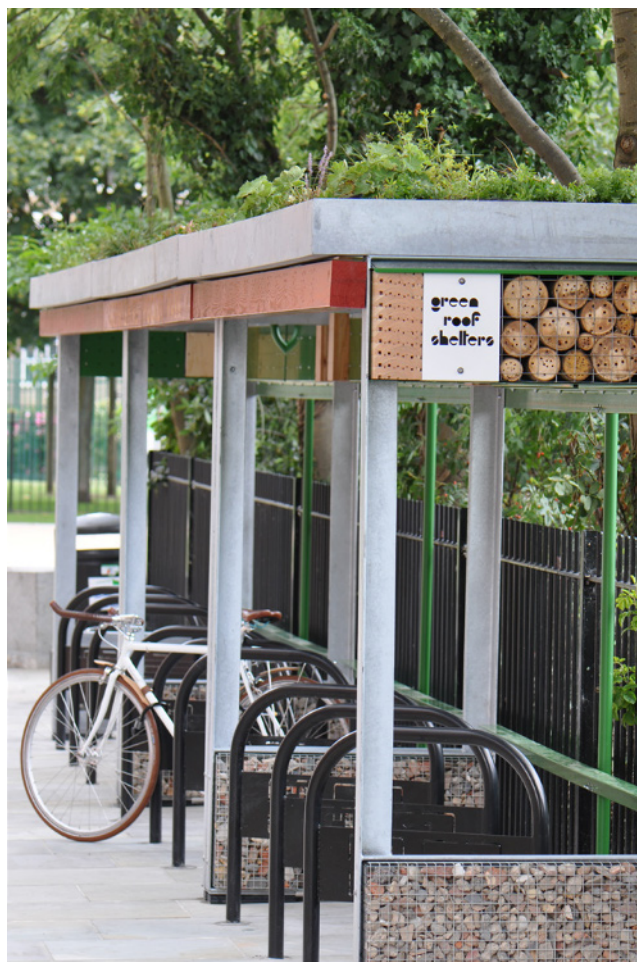
Figure 69 – Bicycle shelters linked to a cycling route providing active travel opportunities, but also providing forage, nesting and refuge opportunities for birds and insects