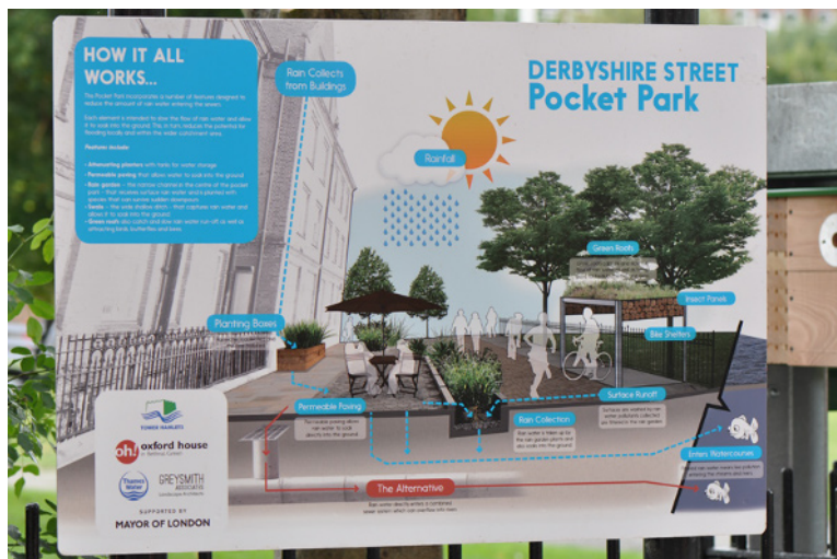
Figure 67 – Information board at Derbyshire Street Pocket Park explaining to residents the NBS design for the space

In the co-creation process, Derbyshire Street was identified for this demonstration, and local and regional co-funding was secured to deliver the design project. A co-production approach to design was adopted, including Greysmith Associated landscape architects, Tower Hamlets Council, Thames Water Ltd, the Greenroof Shelters company, and local stakeholders in the form of the Oxford House Community Centre (an organisation running community classes and events and providing affordable office space for organisations, charities and social businesses involved in the local arts, community and heritage). The resulting award-winning Derbyshire Street Pocket Park (244) now stands as an exemplar of an NBS approach to placemaking and an asset to the local community.