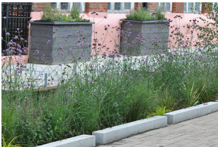
Figure 68 – Pollinator-friendly rain garden, permeable paving and attenuating planters with herbs for local residents to pick at Derbyshire Street Pocket Park