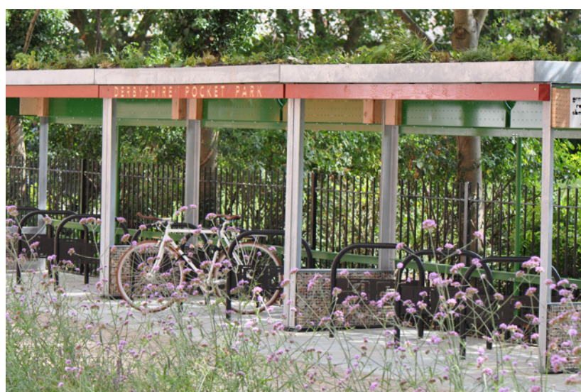
Figure 65 – Derbyshire Street Pocket Park in east London, United Kingdom