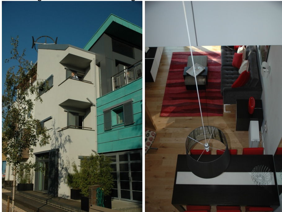
Figure 3: Barratt Green House

has also helped to achieve a good glazing to floor area ratio of 25% [26] providing sufficient natural lighting while maintaining low heat-losses through the window.