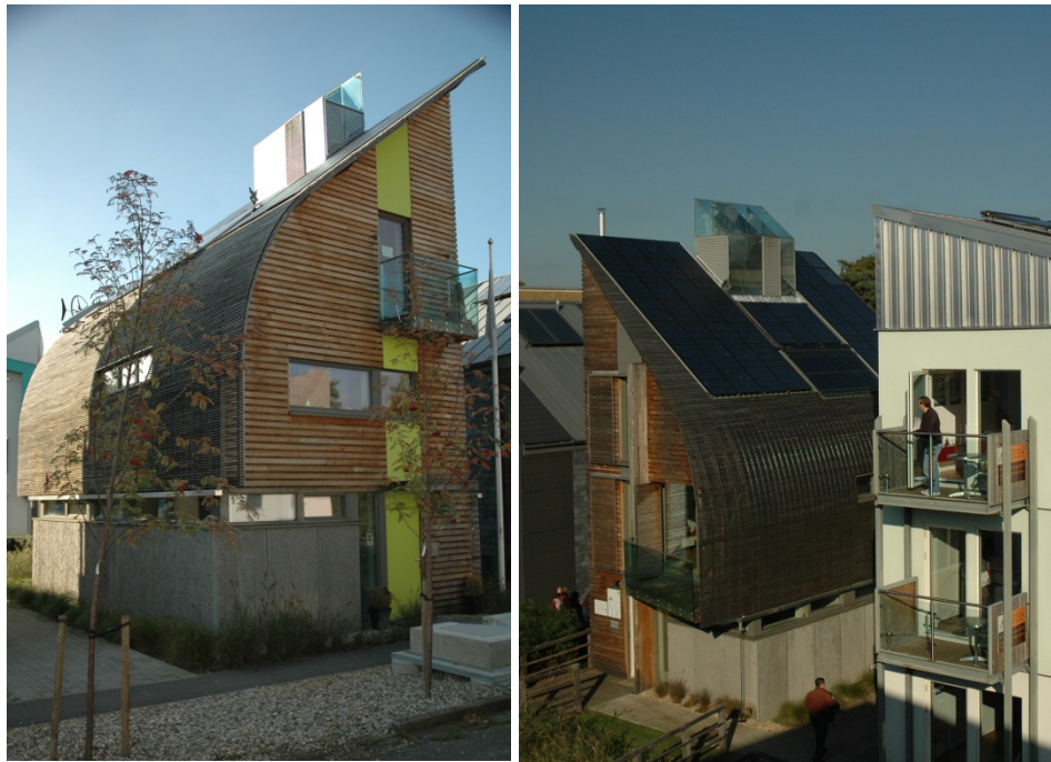
Figure 2: Kingspan Lighthouse

Moreover, proper use of thermal mass, passive ventilation, and solar shading helps to reduce energy consumption as well as maintain the indoor air quality. The rather low average daylight factor of 1.5 to 2% is however an area where improvements could have been made to make the Lighthouse even more environmentally friendly. Having been the first house certified to Code Level 6 standards, Kingspan's Lighthouse was a proper example for the UK's housebuilders and manufacturers during its rather short life from 2007 to 2012. It was demolished adopting a sustainable "zero-waste-to-landfill" approach last year [24].