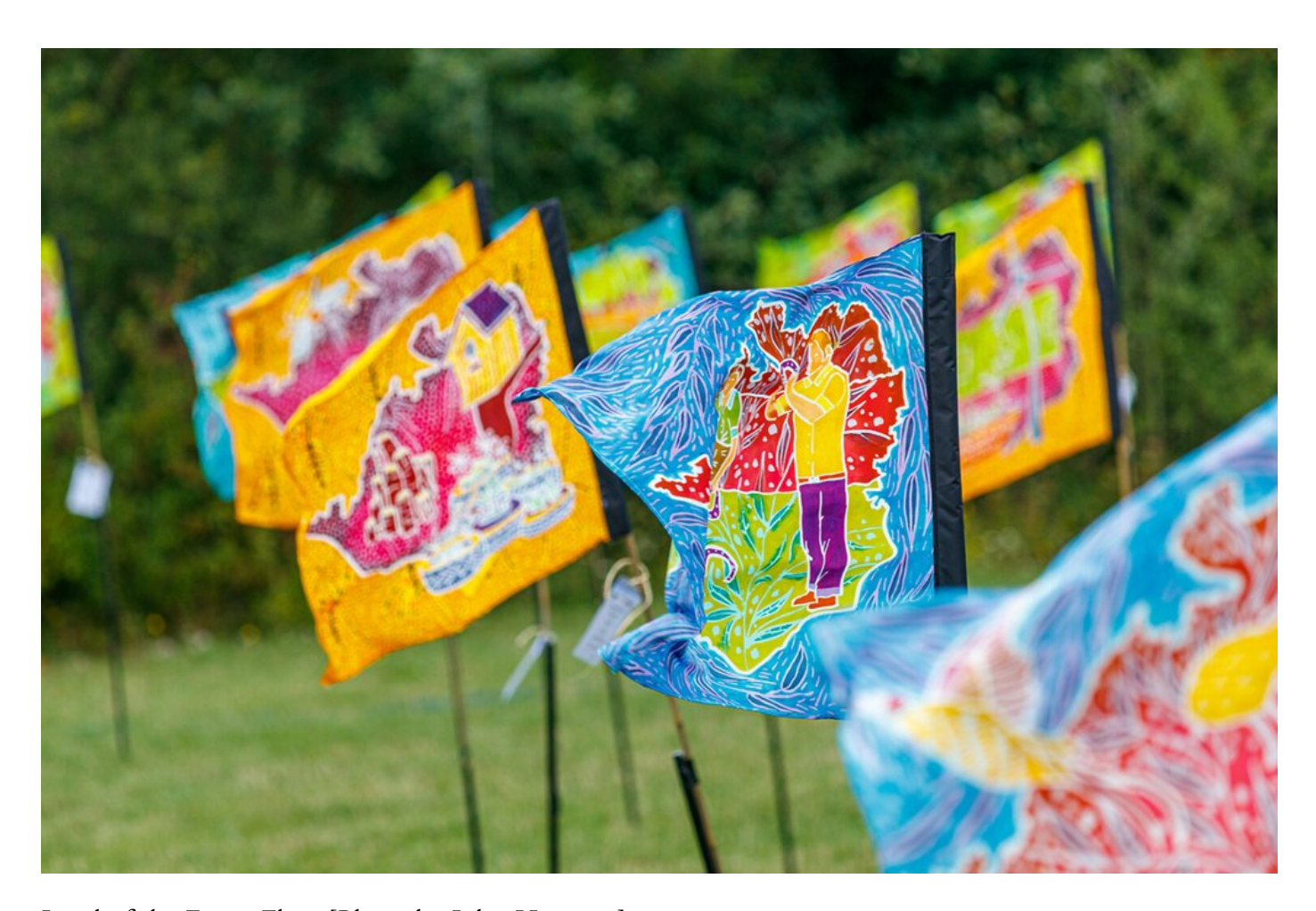
Land of the Fanns Flags

The 100 stories are recorded on the project website, and each has a corresponding flag design; imagery relating to the story framed by the outline shape of the Land of the Fanns region, painted on silk. The flags are brightly coloured; acid yellows, greens and turquoise with hot pink and red outlined in the white distinctive of silk and batik painting. The imagery is varied – waterscapes and flowers, eels and bicycles, cakes and footprints, some are designed and painted by the teller of the story, whilst others have been interpreted or painted from a paper design by Kinetika. As restrictions lifted in late spring 2021 the 100 flags became part of a walking festival 'Tales of the Fanns', pitched en masse in a display and carried by walkers through the landscapes that inspired them.