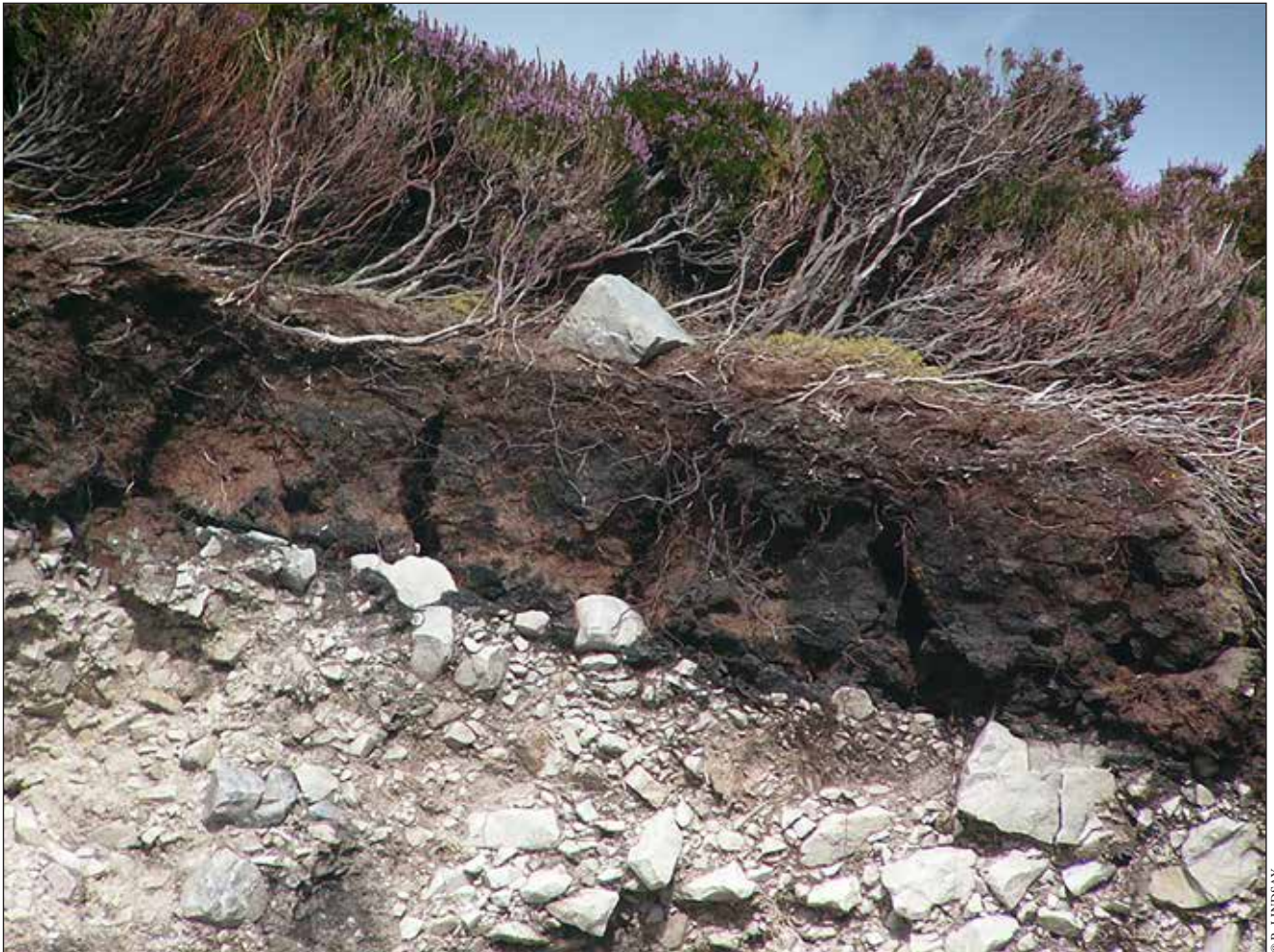
One hectare of peat only 30 cm deep holds as much carbon as 1 hectare of primary tropical rainforest, yet it may be mistaken for other habitats such as heathland and so managed inappropriately. Such a thin layer of peat is more easily destroyed by inappropriate management – the single pass of a plough, for example – than is the case for the loss of the carbon store held in a tropical rainforest, where, even after felling and burning, the roots and stumps of the forest remain. The loss of thin peat does not attract as much world attention as the loss of tropical rainforest, however

known global peatland resource contains more carbon than all the world's vegetation combined (Scharlemann et al. , 2014). The fact that even thin peats (i.e. those peats most vulnerable to land-use change) have the potential to release as much carbon per unit area as the clearing of primary tropical forest lends particular urgency to the need for accurate mapping of these mostly overlooked but potentially very large areas of thinner peat. Even small changes in the mapped extent of national and global peat resources could mean substantial changes to the picture of associated carbon fluxes – whether negatively, in terms of emissions