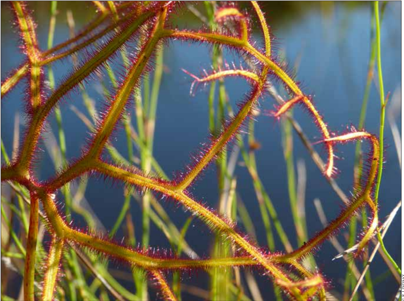
The carnivorous sundew Drosera binnata on the margin of a peat pool formed within a patterned fen peatland near Moon Point, Fraser Island, Australia

Joosten, 2011), many of the PMFB's peatlands are small, discrete and transient over geological timescales. To date, depths of up to 7.5 m have been found (Lähteenoja et al. , 2009), covered by vegetation communities varying from open grass and sedge-rich ecosystems to pole forests and palm swamps, where one particular palm of economic value, Mauritia flexuosa , commonly dominates (Lähteenoja et al. , 2009). People living in and around the peatlands of the PMFB classify and use these ecosystems in various ways (Schulz et al. , 2019), although they tend to avoid them when alternative landscape types are available (L. Cole, personal communication, 2019).