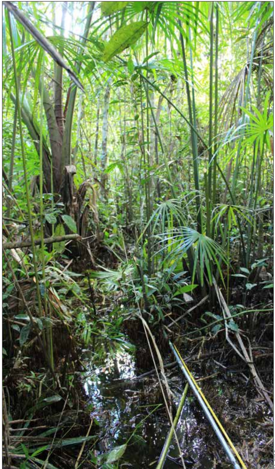
A palm swamp (aguajal) dominated by Mauritia flexuosa in the PMFB, western Amazonia

A similar story of discovery has unfolded in the world's largest river basin, the Amazon, in the last few decades. Some of the first published studies on the peatlands of the Pastaza-Marañón Foreland Basin (PMFB) in western Amazonia in the northern Peruvian lowlands described a peat-rich area of approximately 100 000 km 2 containing 2–20 Gt of carbon (Lähteenoja et al. , 2009). Since then, research has been carried out to refine these estimates and to understand more about the area's developmental processes (Roucoux et al. , 2013; Kelly et al. , 2017) and ecosystem characteristics (Draper et al. , 2014, 2018). Understanding the interannual flood variability, associated environmental disturbances and river-channel dynamics of the Amazon Basin is key to understanding the development of its peatlands (Gumbrecht et al. , 2017). Such factors have created a complex arrangement of environments that are waterlogged throughout the year and thus ideal for the development of peatlands (e.g. Householder et al. , 2012).