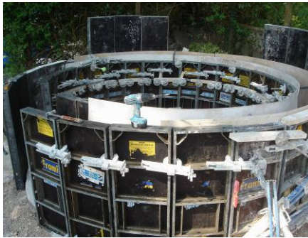
Figure 1: Concrete formwork for rammed chalk - Calyx visitor centre, Dover 2007 by Rowland Keable

Ironically, the advantages of fabric over conventional rigid concrete shuttering also applies to the construction of rammed earth walls and columns. Conventional rammed earth formwork is fundamentally a re-use of standard concrete forms. With up to 80 kNm 2 capacity, these steel framing systems or bespoke timber/ply panel constructions are designed to resist the hydrostatic pressures of liquid concrete, to maintain water tight rigid containment to allow the accurate placement of steel reinforcement and withstand poker vibration. None of these attributes are relevant to earth construction. The dimensions of the system panels are varied, and can carry on average 300 uses per panel. The high quality and cost of these panels is also reflected in the weight, with steel sections generally requiring crane assistance for placement. With timber bespoke panels the variety and size is almost limitless, and whereas the material elements are cheaper on initial outlay, and lighter in weight than the metal systems, the labour time and associated leakage risk on a bespoke system is greater.