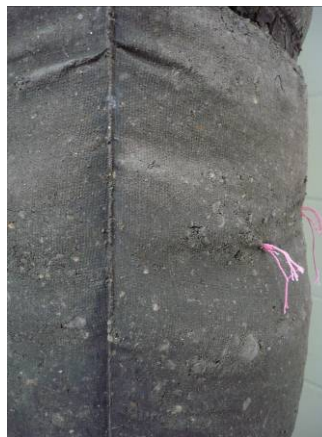
Figure 5: Detail of earth column with restraint thread visible 2007

The use of fabric for concrete columns was developed by Mark West at the University of Manitoba, Canada, refined to fit within a rucksack. However when cast, bracing was required to hold the form during the pour. With the incremental nature of ramming earth – where the layer 150mm below the top surface at any given time is fully compacted, the fabric column form had the ability to ‘grow’ without bracing. Three column forms were developed and tested, the most successful used simple timber slats as vertical clamps to incrementally rise up the column just in advance of the ramming surface.