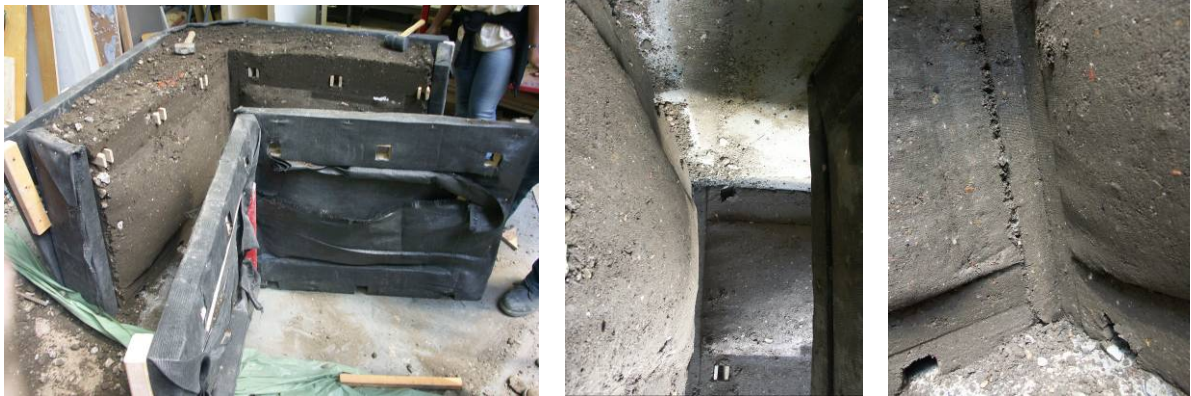
Figure 4: Climbing formwork strike and resulting earth detail

The timber selection proved insufficient – hardwood rather than softwood is required to cope with the pressure even of a hand rammer, which was used for this test rather than pneumatics. However, the result and repeatability of the system was proven, with fine detail and strong compaction, a total of two lifts were completed establishing the validity of the self supporting concept. The framing of the panels was still additional load on the system weight. Further materials reduction was required for the system to be completely portable.