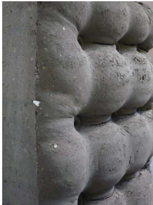
Figure 7: Detail of earth wall without bracing 2008