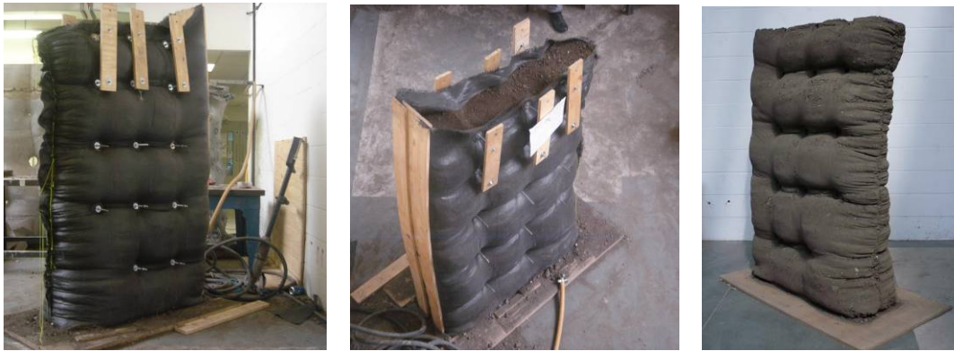
Figure 6: Earth wall system using fabric, bolts and guides 2008

In reflecting upon the ability to ‘grow’ the formwork during the ramming process, the bolt through technique developed at UEL for a concrete form was used – with timber struts ‘borrowing’ support offered by the bolts of the lift below to set out and restrain the bolts above the ramming level. Once the ramming level has passed two bolt levels, the lowest line of bolts may be removed and added to the next layer, further minimising the kit of parts. A simple stitching detail to one end allowed the fabric containment to advance upwards as the earth was rammed. Important innovations in the type of bolt restraint allowed the formwork to be easily removed. In total, excluding the rammer the formwork weighted just over 4 kg for a two metre square panel 350 mm thick.