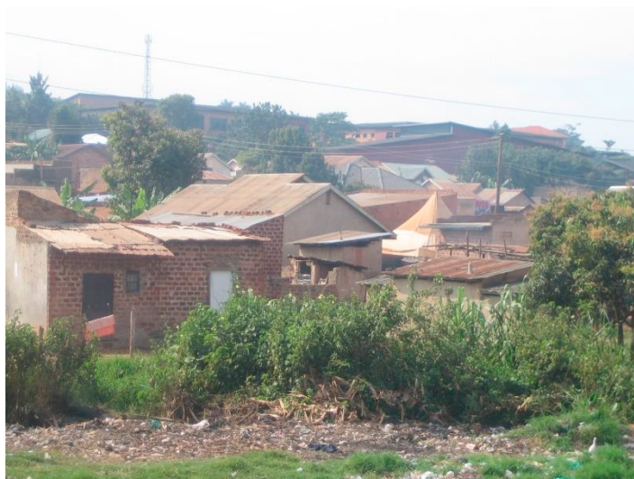
Fig. 1. Low-income housing.

urban population live in slums [4,5] and over 50% live in single-roomed overcrowded properties [6] built from low quality materials (Figure 1). Moreover, rapid urbanisation and growing housing demand are some of the other current challenges of the country [7]. Currently, embodied energy of construction methods and materials seems to be the major challenge which requires immediate attention to mitigate negative environmental effects of the construction industry [8,9].