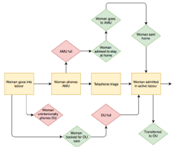
Fig. 5. Women's access to AMUs in early labour.

Woman - Yeah, it felt lush. That's what it is.