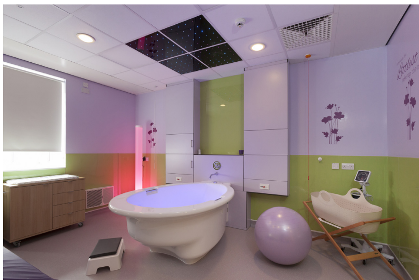
Figs. 1 and 2. Birthing rooms in an Alongside Midwifery Unit (The Meadow Birth Centre, Worcestershire Acute Trust. This was not a case study site).

2010 and 2016 (the most recent census) (Redshaw, 2011; Walsh et al., 2018) and the percentage of women giving birth in AMUs has also increased (Walsh et al., 2018). They are widely seen as the 'best of both worlds' offering a non-technical birth with easy access to specialist care if needed (Newburn 2012).