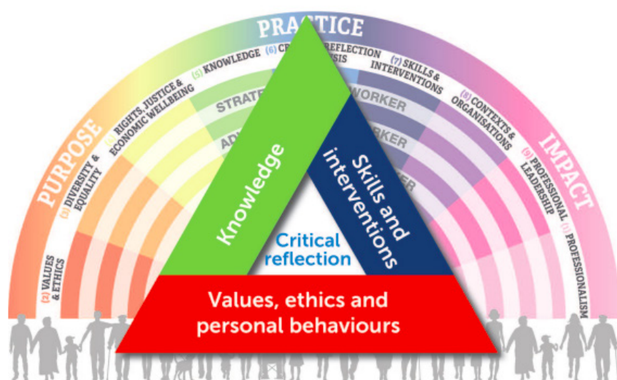
Figure 1. BASW (2018) Professional Capabilities Framework – social work level capabilities: www.basw.co.uk/pcf/PCF05SocialWorkLevelCapabilities.pdf (accessed 29 December 2021).

The Advocacy Pathway involves a partnership and way of working which has been developed through a decade-long relationship between the RIX at UEL and CPA, a special secondary school in London. Following 20 years of research and development, RIX have established a new way of working with people with lived experience of learning disability using multimedia, called Multimedia Advocacy. As part of their approach, they have also developed an online, easy-to-build secure platform called RIX Wiki, which enables people with additional needs to use multimedia to communicate their viewpoints, wishes and preferences. The Multimedia Advocacy approach is based on the values and principles of