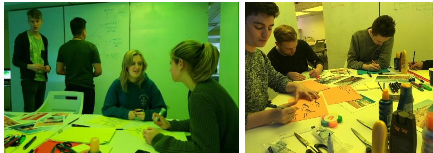
Figure 3. Participants engaged in the co-design session

During the sessions, all participants were encouraged to ideate sun protection interventions to improve young men's sun protection behaviour. The participants started by brainstorming ideas as a group and identifying the specific challenges around their sun protection practices on the beach. The nature of this method empowers the participants to become the experts and design interventions based on their reflections. They immediately began to brainstorm ideas about their sun protection practices, as well as talking about the particular challenges they had faced when using sunscreens.