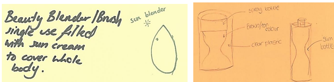
Figure 5. The design outcomes by two female participants

Next, two female participants design the following design outcome. As the participants' said: "this is a female body shape sunscreen bottle and a sponge soaked in sunscreen and will be designed for men and women similar to women's makeup sponge for applying makeup foundation or moisturiser, the colour will be pink or light pink".