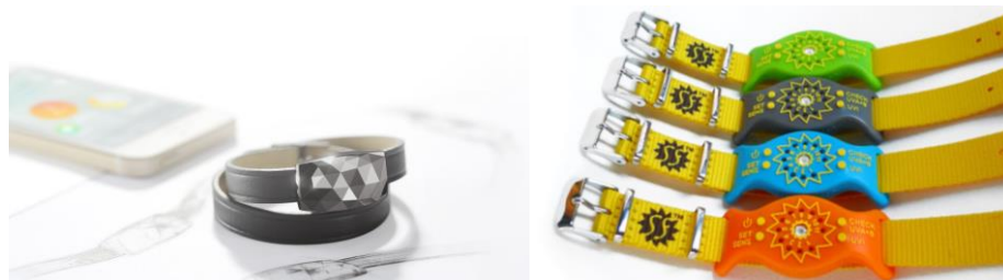
Figure 2. Wearable UV sensors by 'Spinali' Design and 'SunFriend' (Spinoff.Nasa, 2014)

In 2014, a French company Netatmo, specialising in connected objects, released a sun awareness bracelet, designed by Camille Toupet using technology that measures the level of UV exposure. This wearable device connects to smartphones through Bluetooth to alert the user about the level of their exposure to the sun and alert the user to protect their skin and re-apply sunscreen (Netatmo, 2014). A wearable UV meter wristband called 'SunFriend' consists of a NASA-inspired UV sensor with LED indicators to alert users' maximum sun exposure time compatible to the user's type of the skin (Figure 2). The SunFriend was selected as the best consumer product by NASA aimed to encourage people to get enough vitamin D as well as reducing the rates of skin cancer (Spinoff.Nasa, 2014).