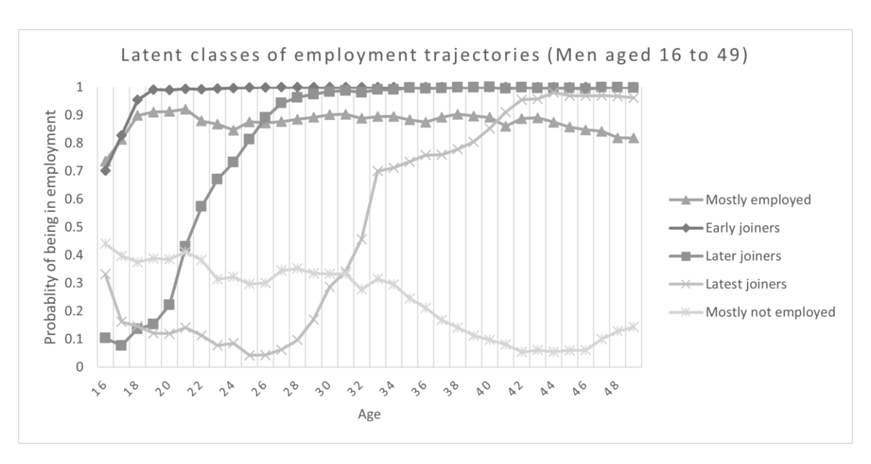
Figure 3. Latent classes of employment trajectories (men aged 16 to 49).