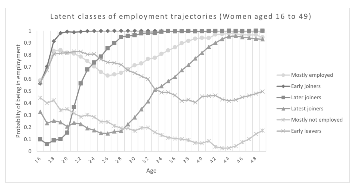
Figure 2. Latent classes of employment trajectories (women aged 16 to 49).