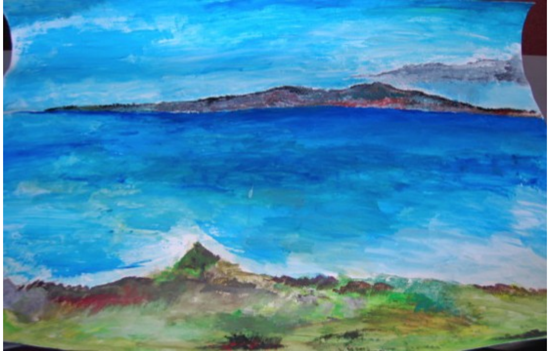
Illustration 4: Samoya's landscape

"Samoya: I really like it, like, it's more peaceful and 'cause we live in the city and where it's so busy, you can see that picture and it's really calm.