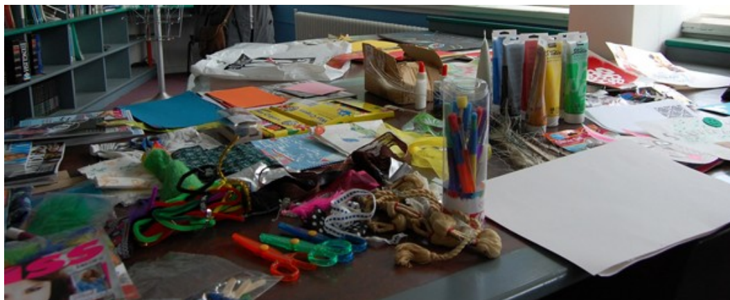
Illustration 2: Desk with workshop material [13]

Participants were provided with a range of image-making resources such as acrylic paint, colored pencils, crayons and craft materials. The participants were asked to create visual images about any aspect of their lives. They were not given any specific instructions, although ESIN and SQUIRE suggested that participants could, for example, make a poster for an imagined movie of their lives or a cover image for a book about their life. The research team facilitated and participated in the workshops by engaging in conversations with the group about various aspects of everyday life such as life at school/university, families and friends. Each member of the research team also made one or more images about their life. The research team kept field notes about activities in the workshops. They also photographed the image-making process in order to document the ways in which participants shaped and appropriated the social space of the workshops. [14]