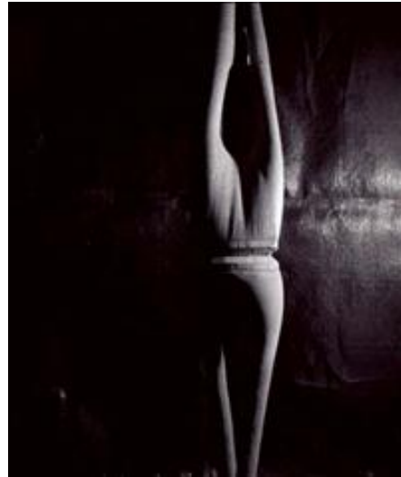
Concrete column by students at Edinburgh University made using flexible formwork

Interest in the technology is growing – a conference organised by the International Society of Fabric Formers was held in Manitoba, Canada, in May. Fabric formwork technology is actually very old – rammed earth within hessian sheets was first used 2,000 years ago. But a new generation of designers is reinventing it as a sustainable construction method for the 21st century – the work of three of them is introduced here.