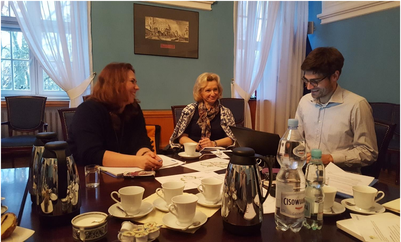
Figure 2. Nature-based solution interviews in the City of Poznań.