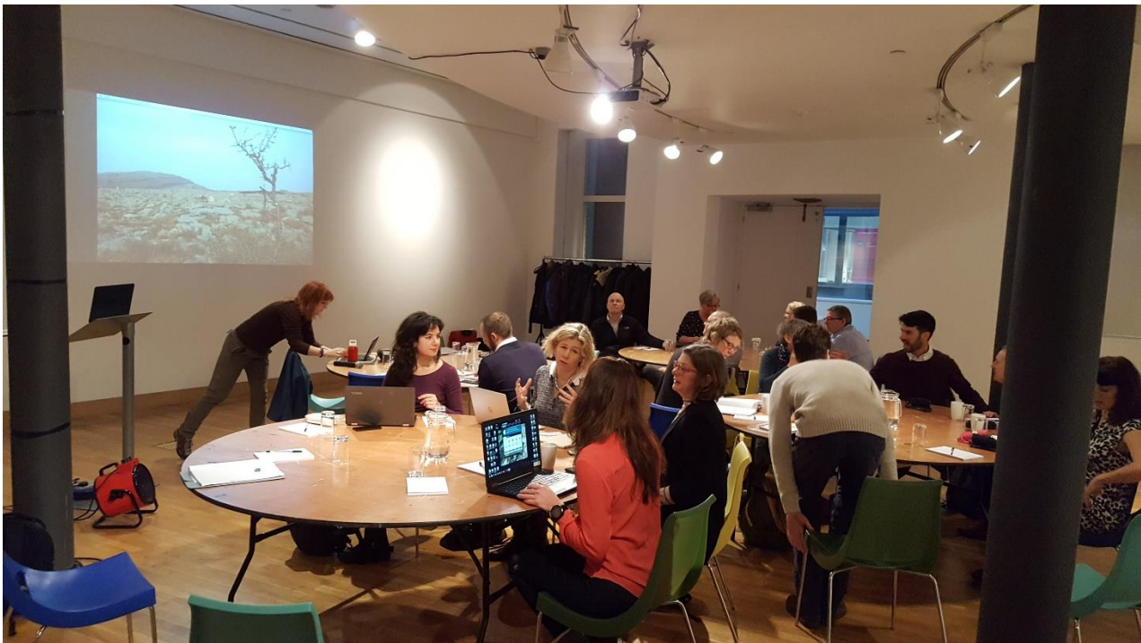
Figure 5. Example of Debrief Meeting in Glasgow, Scotland.