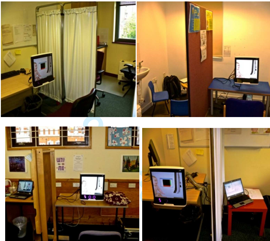
Figure 3: Photographs of differing set-ups in four CCs

1 2 3 4 5 6 7 8 9 10 11 12 13 14 15 16 17 18 19 20 21 22 23 24 25 26 27 28 29 30 31 32 33 34 35 36 37 38 39 40 41 42 43 44 45 46 47 48 49 50 51 52 53 54 55 56 57 58 59 60