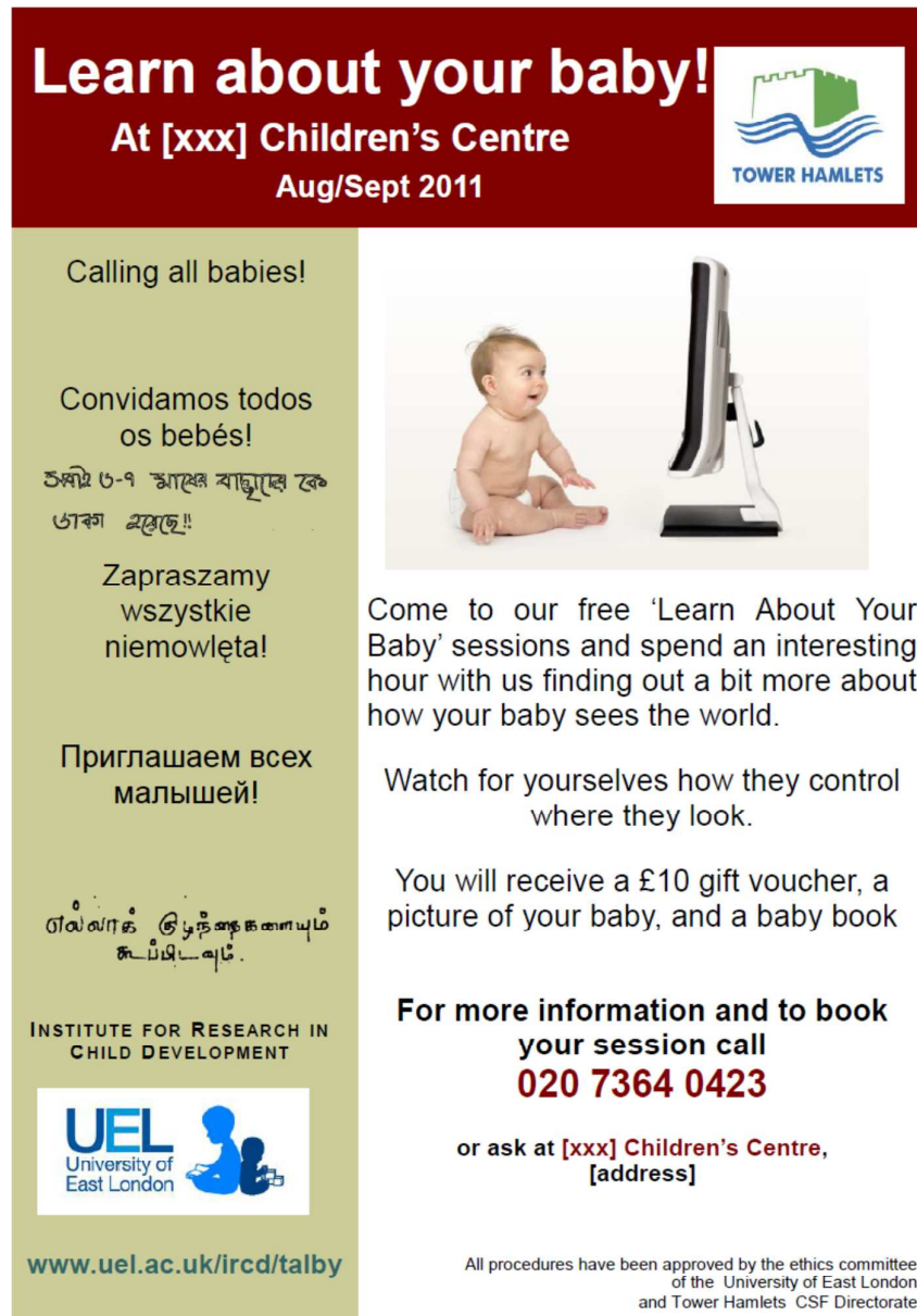
Figure 1: Poster used for recruitment in Tower Hamlets local authority centres

1 2 3 4 5 6 7 8 9 10 11 12 13 14 15 16 17 18 19 20 21 22 23 24 25 26 27 28 29 30 31 32 33 34 35 36 37 38 39 40 41 42 43 44 45 46 47 48 49 50 51 52 53 54 55 56 57 58 59 60