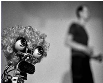
Figure 3: Media Lab Europe's "JoeRobot" in 'her' first transformation to Josephine, in the Flutterfugue performance with SmartLab and NYU CATLab: London, July 2002