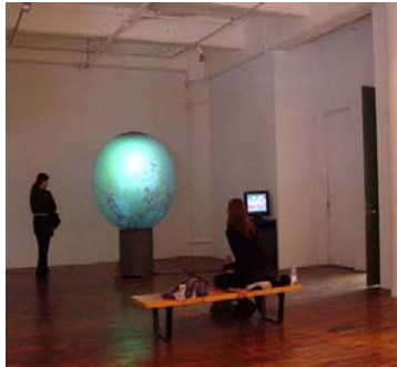
Figure 5: The Omniglobe is installed in the AIR Gallery (with the help of artist Camille Utterback)

The OmniGlobe offers, in practice, a spherical computer screen, ideal for telling stories 'in the round'. The AIR GALLERY studio show of April 2004 showed a new version of the Anima Story on the globe, and also included split screen projection of the live dance and responsive screen feedback from earlier versions, with improvised live dance on site with an integrated olfactory sculpture made by Gayil Nalls.