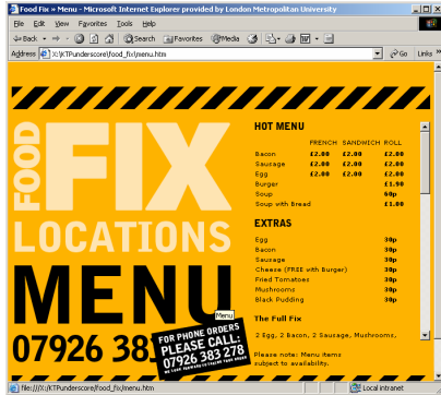
Figure 2. Food Fix Menu – With CSS.

The first line ensures that the basic.css is available for all browsers and devices, new and old. The second line uses a “hack” technique that only allows certain modern browsers to render the modern.css styles [4]. Figure 2 illustrates the scrolling food menu rendered according to the rules defined in the two cascading stylesheets.