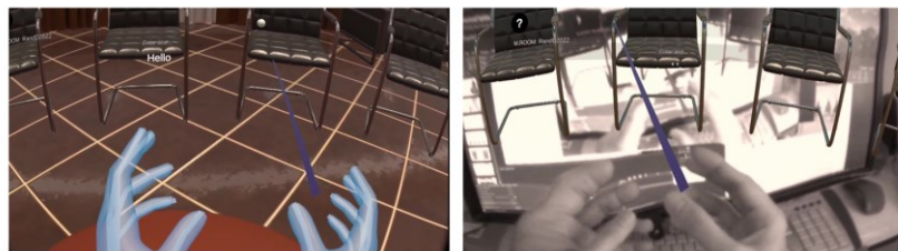
Fig. 4. Left: Hand tracking in VR mode with the Oculus Quest 2. Here, the right hand has the pointer, which means it is controlling, active, or dominant. Right: Hand tracking in MR mode with the Oculus Quest 2. Here, the camera feed of the actual hands are visible, and the right hand has the pointer, which means it is controlling, active, or dominant. This is a render buffer capture using SideQuest software.

For the headset devices, Oculus Quest 2 and Hololens 2, hand tracking is in operation to interact with the UI, enabling the user to control the environment without handheld controllers in VR and MR modes, see Fig. 4. Users switch the controlling hand by pinching the thumb and ring fingers on the respective hand. The pointer will move to indicate the active hand, as with the handheld controller. Scaling, positioning, and rotation of the avatars and avatar seating is available in MR mode, see Fig. 5. Rotation is limited to the Y-axis, whereas positioning uses the entire 3D space. The user's avatar and chair placement initialise on the top of the 3D overlaid controller.