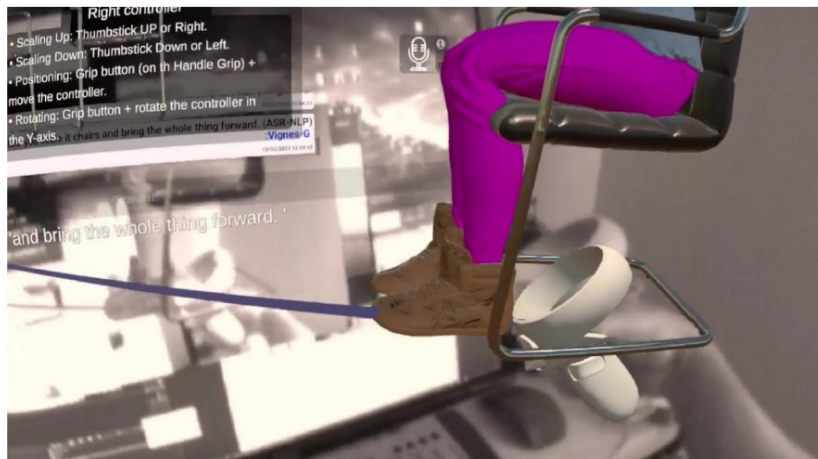
Fig. 5. In MR mode, the user's avatar and chairs are scaled, positioned, and rotated in the Y-axis next to the computer screen. Positioning and rotation are done using the handheld controller's position and rotation. In this case, the right-hand controller is visible in the background. It is possible to observe that the hand is bending to rotate the controller for avatar and chair rotation in the Y-axis. This is a render buffer capture using SideQuest software.