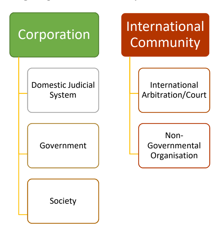
Diagram 2. Plotting Corporate Accountability

The theoretical conception behind the diagram is that accountability takes the form of social relations and business operations. It may be the case therefore that these diagrams show that corporate accountability may have both horizontal and vertical interactions. This means that the corporate interaction is a relationship between the government and society. Therefore, the concept of accountability is derived from the corporate relationship. This relationship forms the foundation of legal accountability and the basis for analysing corporate conduct, government, and society. Hence, the concept as explained above confirms that accountability exists when corporations, government and society, are operating within social relations. It is argued that where there exist social relations and that it does not matter whether there are other elements that aid or give rise to misconduct of the corporation or 'human rights violations'. 604