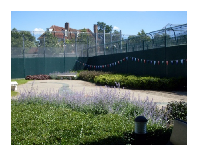
Figure 1: Forensic unit garden

The space in this photograph is a complex and contradictory one. In the foreground, there is a well cultivated garden featuring a bench, seemingly positioned for quiet reflection. Beds of lavender evoke repose and restoration. Flags indicate a sense of community and celebration. As the eye travels up the image, however, the height of the surrounding fences troubles this peaceful picture. Upon closer inspection these fences are not only high, but hostile and laced with barbed wire. Whether designed to keep the world out, or the users of the garden in, these fences stand in stark contrast to the restorative garden below. Threat of harm, whether past or potential, permeates the space; what else could have necessitated such intimidating structures.