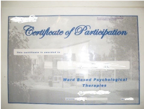
Figure 2: Patient photographs of certificates and goals

On the use of the whiteboard, the patient commented: