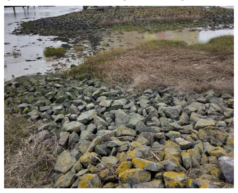
Figure 8: Ralph Overill (2020) The rocks. Photograph

I remembered previous similar hesitations; slipping on the pebbled verge to the A13 bridge (feral children watching 20 feet below) or being spotted by a fisherman while preparing to spray red octopus tentacles over Grays' riverbank. Each time I had to push myself further – increasing danger, risk, but the rewards were great and the regrets, so far, had been none.