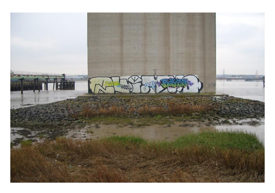
Figure 5: Richard Overill (2020) The gap. Photograph

We were under the bridge. The pillars, more like walls, reached up vertiginously. Lorries traversing sections of reinforced concrete echoed like colliding asteroids in the space above.