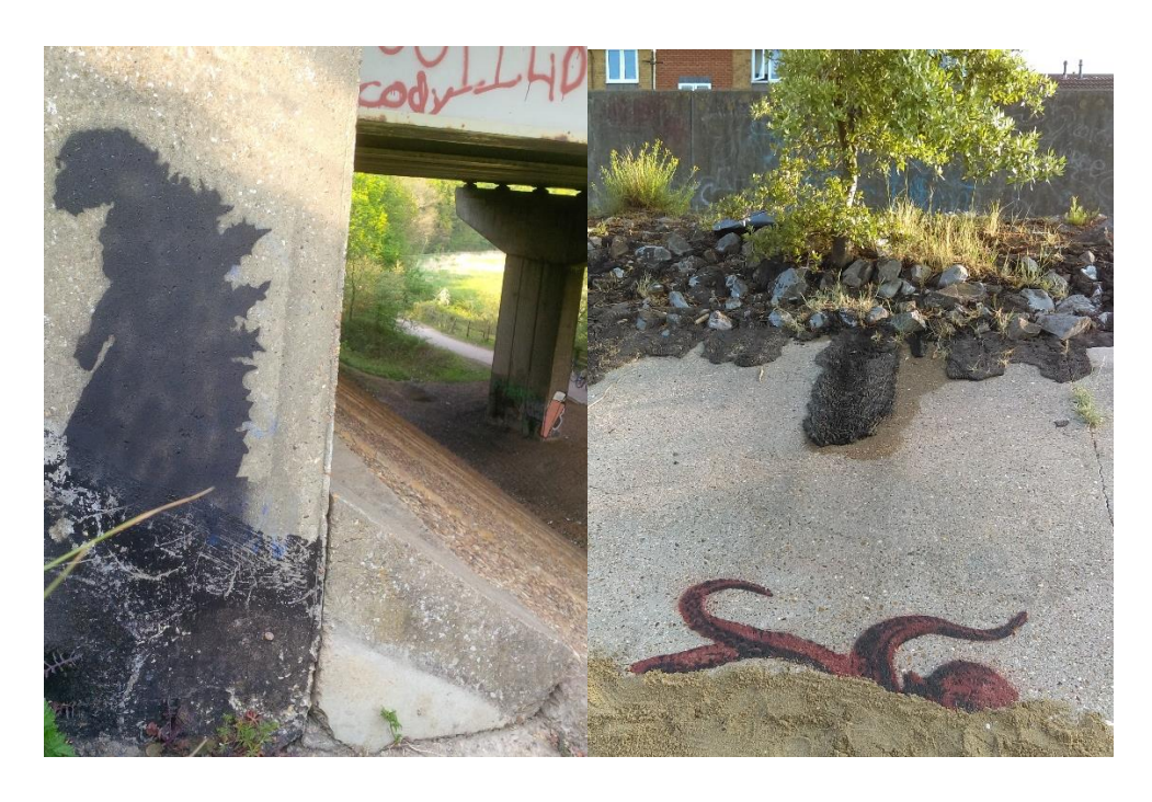
Figure 7: Ralph Overill (2020) Previous hesitations. Photographs

Wrong shoes. White leather K Swiss, half a size too big, donated by the father-in-law (only 2 miles down the path in Purfleet). I clutched the portfolio in one hand, rigging tape and spray paint in coat pockets. Bag relegated to watching with the old man. Had to travel light. I reached the mud, one foot sank and slipped laterally, Thames diarrhoea lapping my laces. Maybe I should come back another time with boots, what if I lose a shoe, get stuck, break an ankle in the rocks?