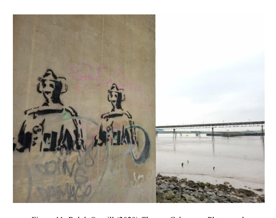
Figure 11: Ralph Overill (2020) Thames Cybermen. Photograph

I realised I was truly between: an outland, a non-place, floating in the margin, I was under the skin of the dividing line. The sound of the unreachable traffic stretched down to me, distorted, alien. Tide coming in – how long had I been out here? Dr Who playing tricks again; time and space out of joint – Cyberman fossils found in 2020 under the M25. Make it back to the Essex shore.