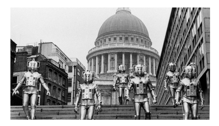
Figure 2: Doctor Who (1967) The invasion. Film still

sensibilities as an artist, and so, the image had been traced, the card incised, (offcuts scattered over a cluttered living room floor) ready for an opportunity to deploy.