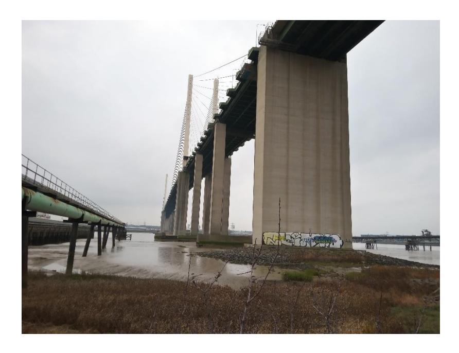
Figure 4: Ralph Overill (2020) Under the bridge. Photograph

memories of a lost celluloid future clinging to reality – the space between Thurrock and Dartford.