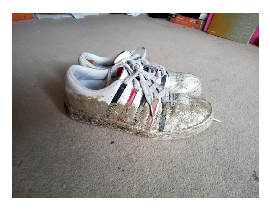
Figure 6: Ralph Overill (2020) Wrong shoes. Photograph

Wrong shoes. White leather K Swiss, half a size too big, donated by the father-in-law (only 2 miles down the path in Purfleet). I clutched the portfolio in one hand, rigging tape and spray paint in coat pockets. Bag relegated to watching with the old man. Had to travel light. I reached the mud, one foot sank and slipped laterally, Thames diarrhoea lapping my laces. Maybe I should come back another time with boots, what if I lose a shoe, get stuck, break an ankle in the rocks?