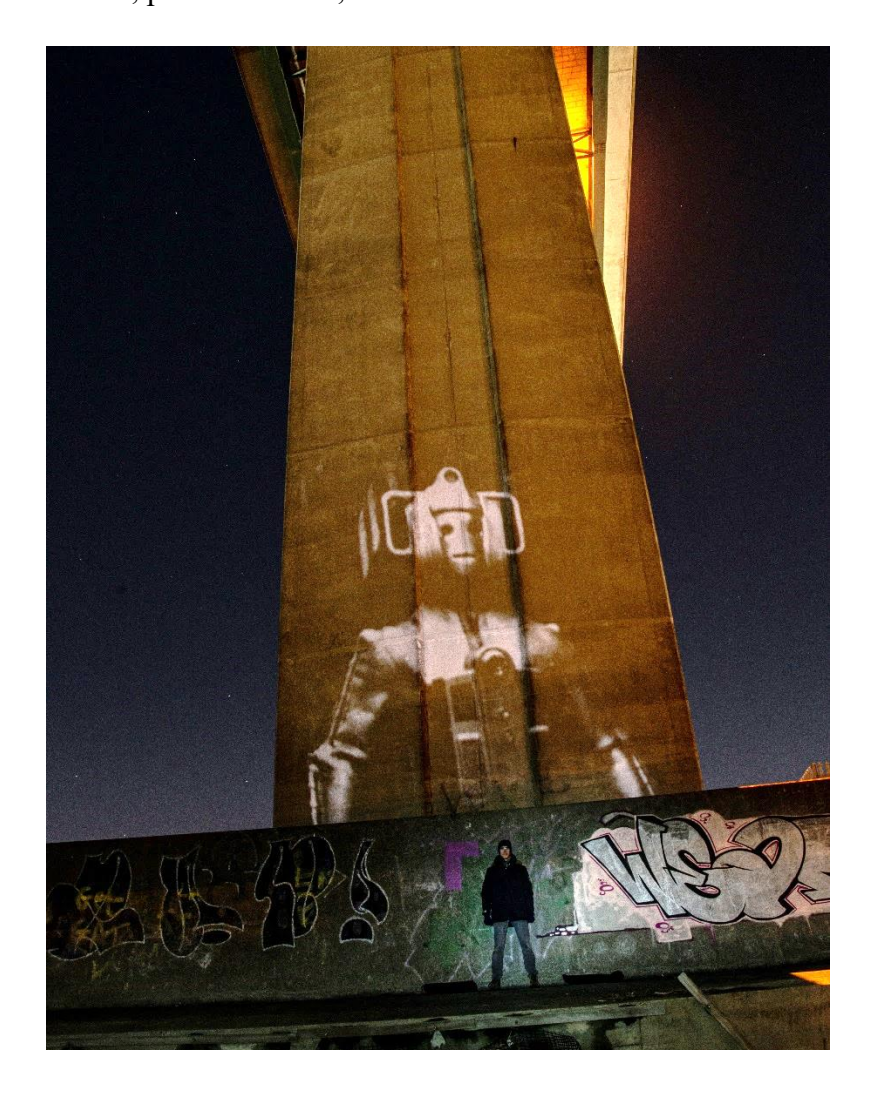
Figure 13: Ralph Overill (2020) Ralph with Cyberman.

a Jurassic swamp on Mars' (Smithson, 1963, p.3). I had found Ground Zero – a collision between road and river, past and future, monster and maker.