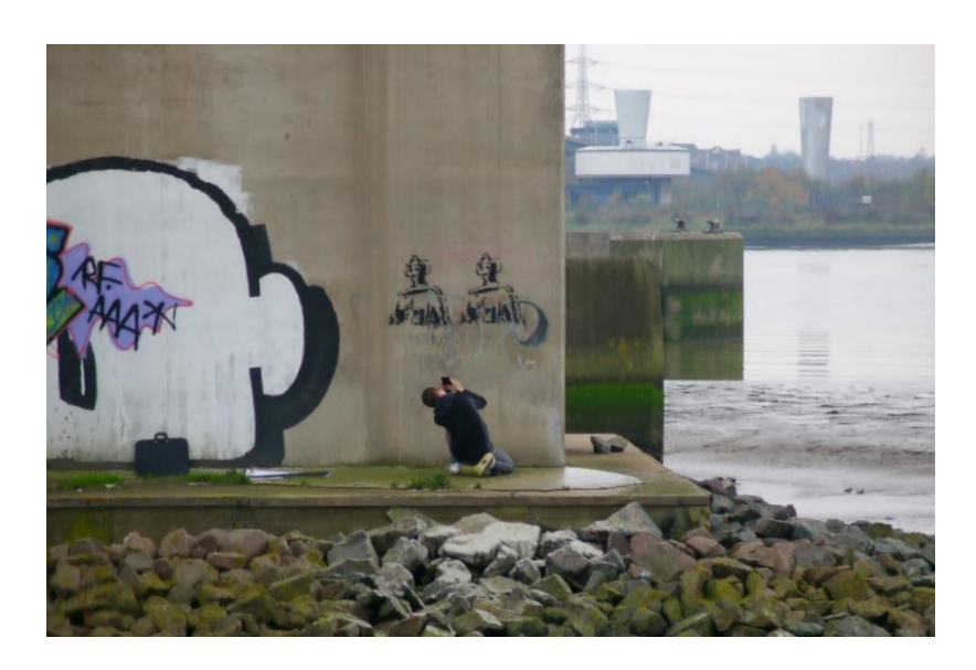
Figure 10: Ralph Overill (2020) Between.

The concrete was rough, sandy; flecked with decades of silt and tide wash, but the tape stuck, the spray paint adhered. The Cybermen rose out of the Thames; one, two ...spray can ran empty. I looked back to Thurrock and Dad observing, along with a teenage couple who had decided to watch this afternoon entertainment.