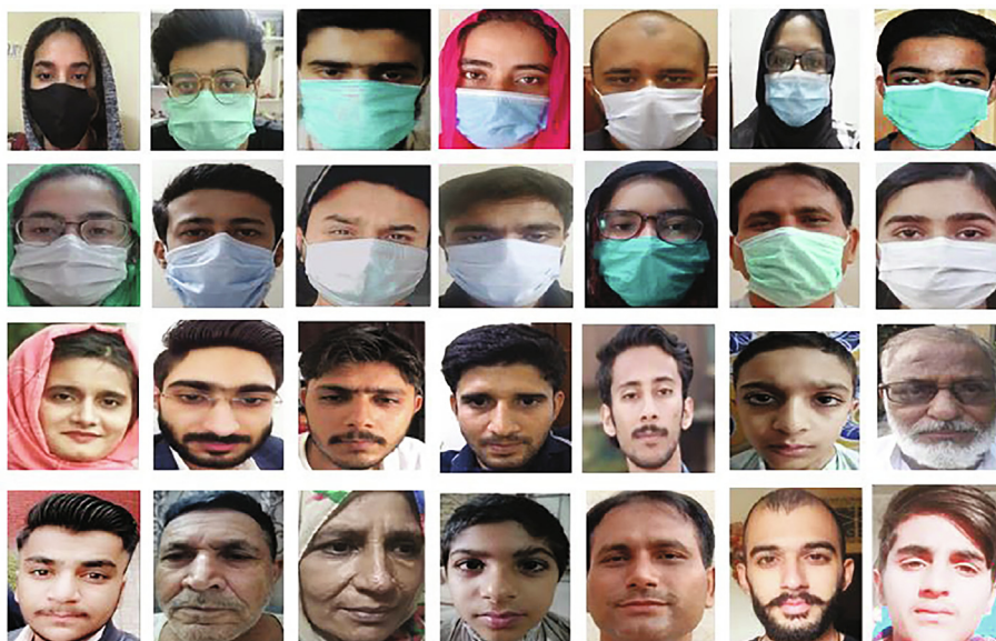
Fig. 3. Sample images of our MDMFR dataset.