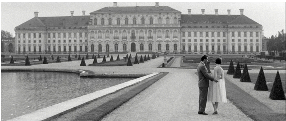
Figs. 2 + 3 Transgressing time and place, X and A pass through a perspective drawing into the landscape depicted. Last Year in Marienbad , (Alain Resnais, 1961)

The camera constantly draws our attention to these images, which are perspectival, and then draws us into them. Like the mirrors, these images are a trope of the film, by which it recognises itself. Characters such as M, or generic hotel guests, stare at them as they hang on the wall, drawing our attention to them. In one scene the false perspective seems to become alive, as if animated.