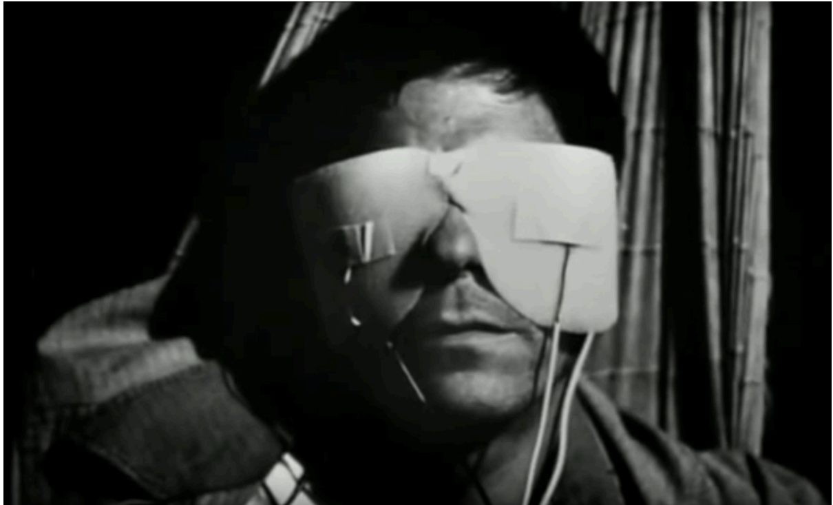
Fig. 4 His eyes are covered by a white mask, from which wires protrude, suggesting that scientists can both see and control his dreams. La Jetée , (Chris Marker, 1962)