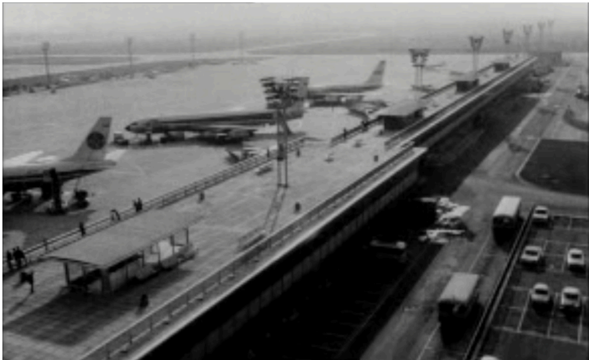
Figure 1. Observation Deck at Orly airport, La Jetée , Chris Marker, 1962.

from everyday concerns. Embarkation is always a symbol of the future, and an adventure into distant unknown places, or to take off into our imagination, the flight of fancy.