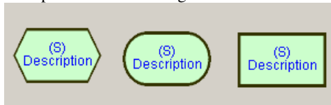
Figure 2. Graphical representation of secure entities (task, goal, and resource, respectively)

resource. Secure Entities are represented graphically by introducing an S within brackets (S) before the text description as shown in figure 2.