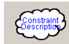
Figure 1. A graphical representation of a security constraint

A security constraint is represented graphically as shown in figure 1.