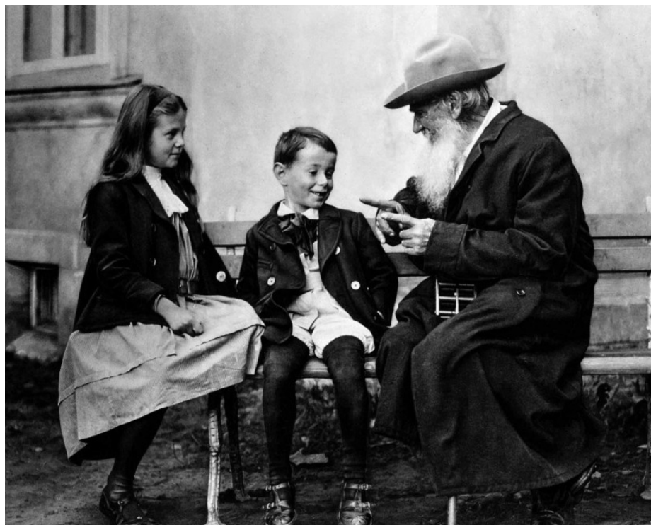
Tolstoy avec ses petits-enfants, C/o Wikimedia Commons Free Repository

inventing new methods, and, above all, not a blind adherence to one method, but the conviction that all methods are one-sided, and that the best method would be the one which would answer best to all the possible difficulties incurred by a pupil, that is not a method, but an art and talent.' Tolstoy (1972: 58)