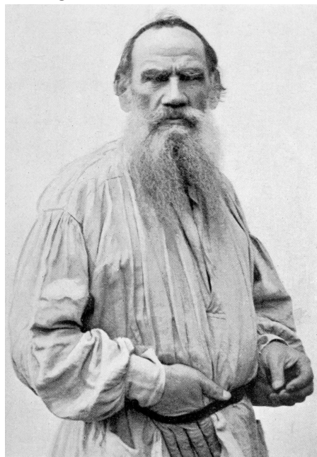
Tolstoy 1895